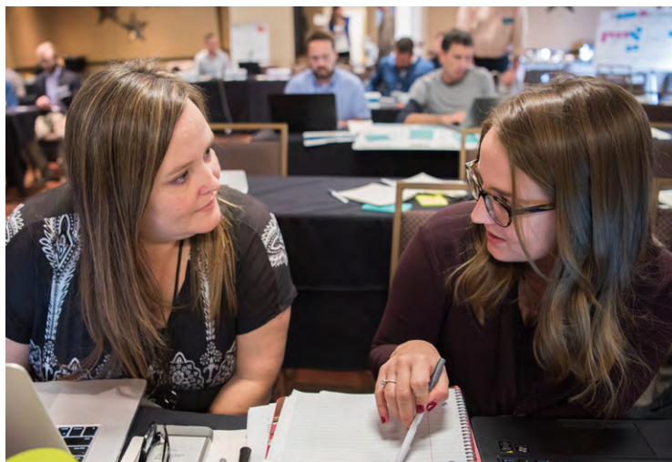
Teams from the fourth class analyze market pathways for their early stage technologies. This is just one of many hands-on activities DOE Lab-Corps participants complete with support from industry mentors and instructors from the clean energy sector.